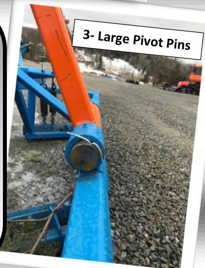
3- Large Pivot Pins