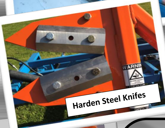
Harden Steel Knives